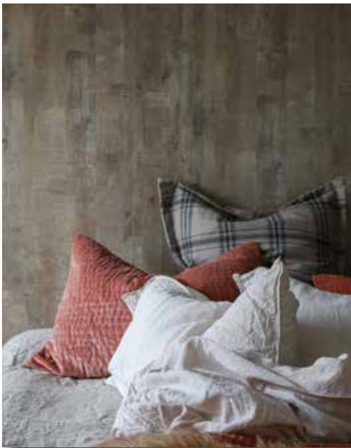
Decor 10462 Rustic oak