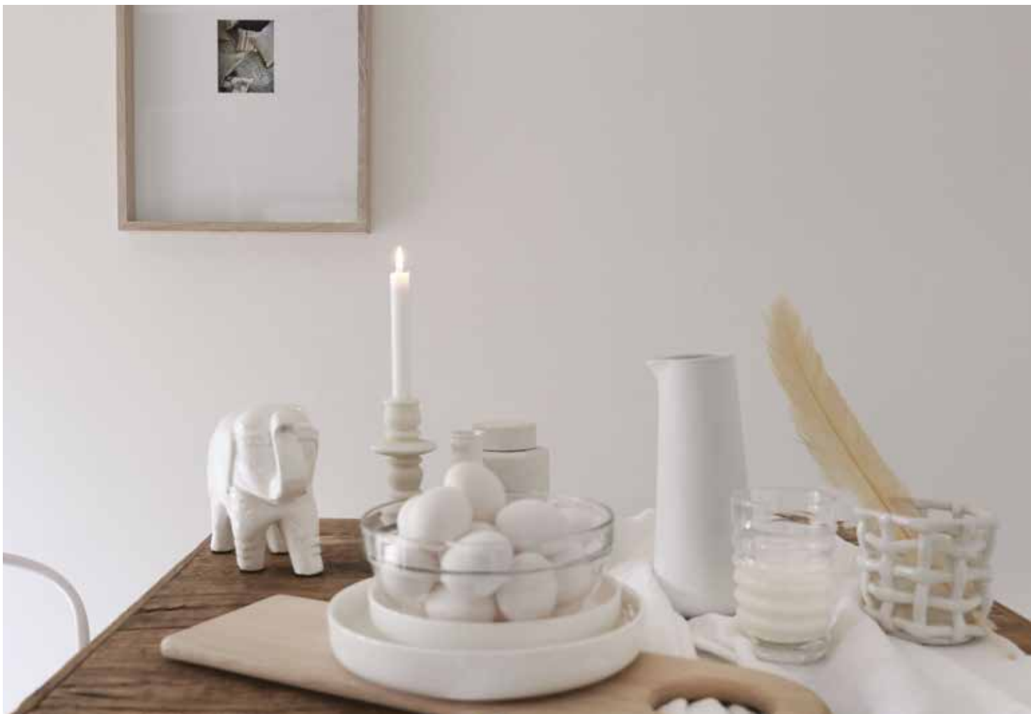
Decor 4147 White deco