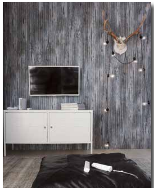
Decor 10452 Crusoe