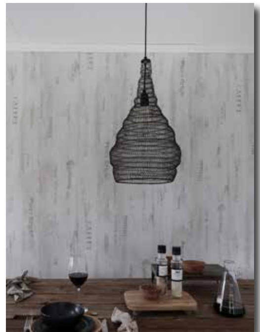
Decor 10442 Winebox light grey