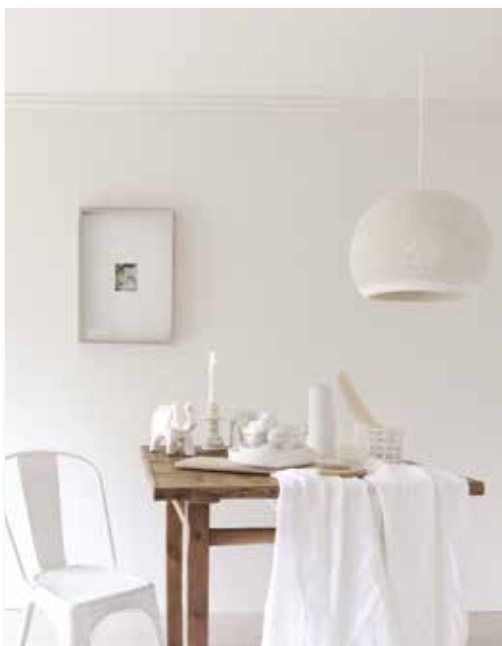
Decor 4147 White deco