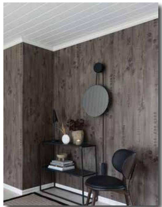
Decor 10432 Winebox

Comprises simpler and classic decorative finishes with understated surface for delicate, light and timeless rooms. Equally suitable in both private rooms as well as public environments.