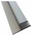
Horizontally divided moulding

All mouldings are in aluminium, and can be delivered in natural and white (with the exception of skirting mould, which are only delivered in natural).