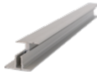
Vertical two-part extension moulding