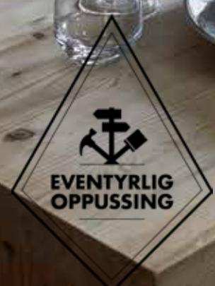
Photo: Forestia Walls2paint from the Norwegian TV-show "Eventyrlig Oppussing"

www.forestia.com E-mail: forestia.customerservice@byggma.no